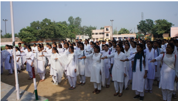
National Unity day observed on 31stOct 2019 in GDC Bishnah