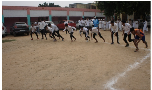
College organizes athletic meet on 1.11.2019 on 550 th Birth Anniversary of Guru Nank Dev ji