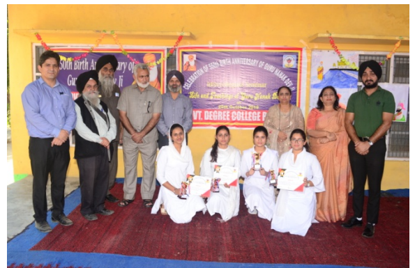
College organizes an inter-collegiate seminar on Life and Teachings of Guru Nanak Devji on 25.10.2019