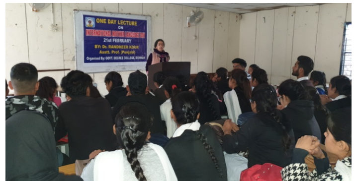
International Mother Language Day celebrated on 20.02.2020

✚ A National Webinar on “Employability and Skill Gap” was Organised by GDC Bishnah in Collaboration with Counselling Cell Higher Education, UT of J&K for Students and faculty on 10 th July, 2020.