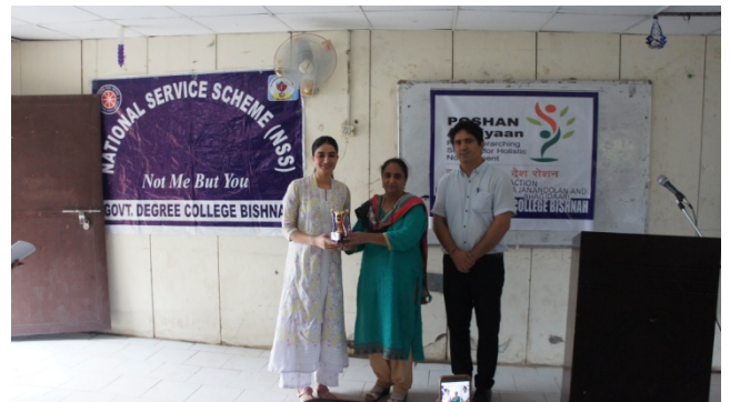
NSS unit of GDC Bishnah organised Poshan Abhiyaan On 28.09.2019