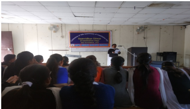
Symposium organised by College NSS Unit on National Constitution day on 26.11.2019