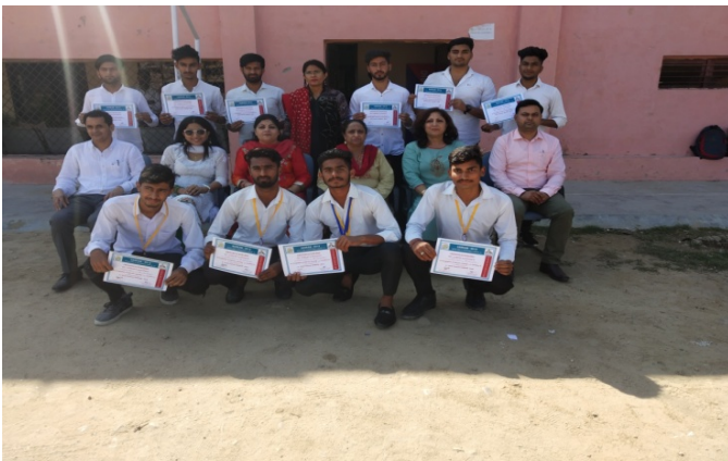
College participated in 5 days youth festival Sangam-19 from 11th Oct-2019 to 15th Oct 2019