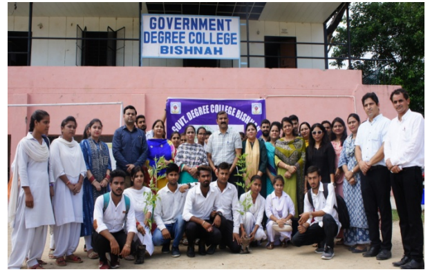
College organises plantation drive on 31.08.2019