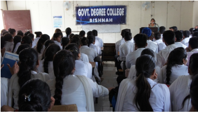
College organised a function on 03.08.2019 to inaugurate Newly constituted curricular and co curricular clubs