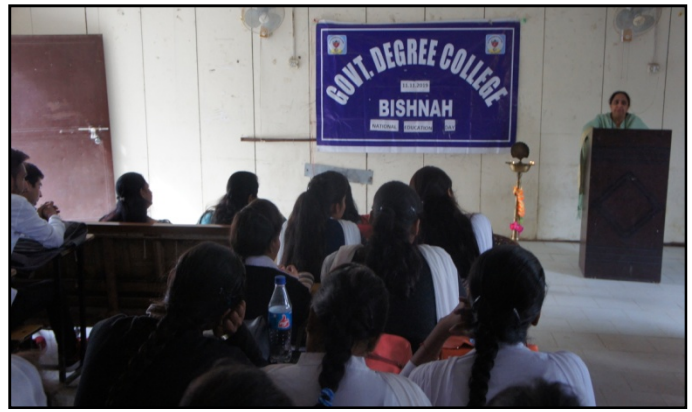
College celebrated National Education day on 11.11.2019