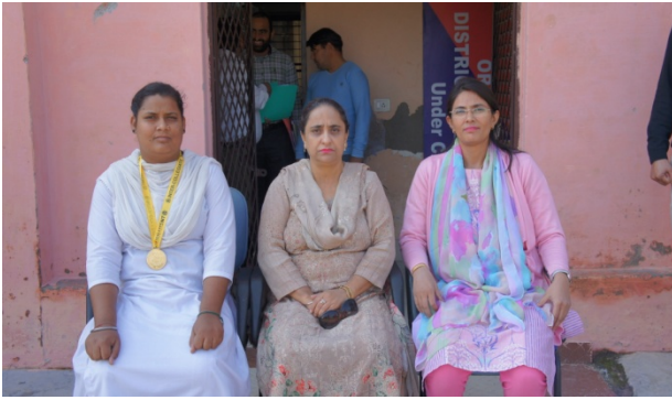
Student of B.A Sem-Ist of GDC Bishnah won gold Medal under super Heavy weight in Jammu University from 04.11.2019 to 6,11,2019