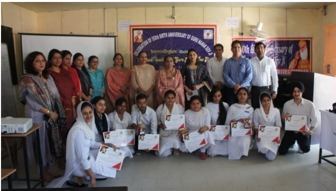
College organizes an inter collegiate quiz competition on 5.11.2019 on Life and preachings of Guru nanak Dev ji